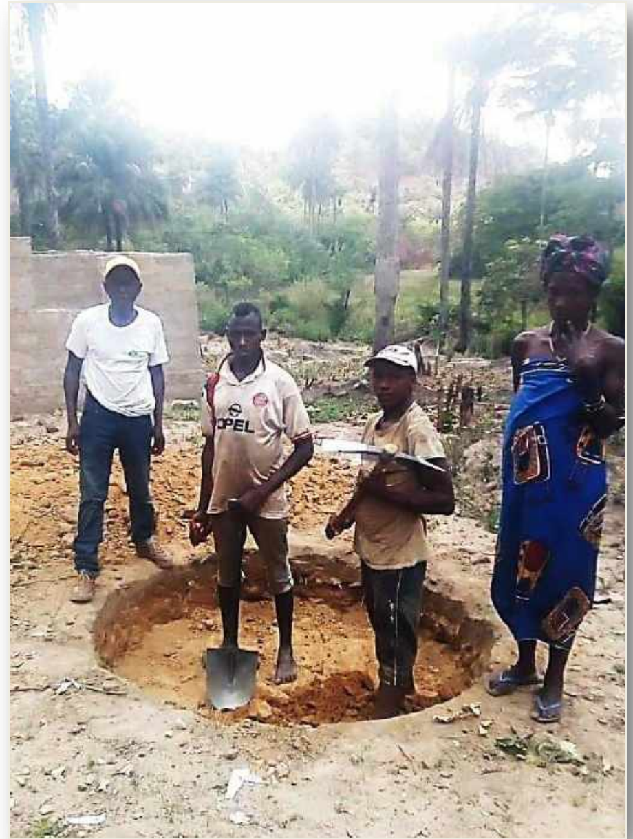
Working began on the clinic well approx 18 months ago.